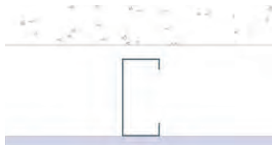
Free Span Ceiling System